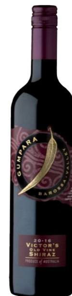
$30-$35 Gumpara Victor's Old Vine Barossa Valley Shiraz 2016 ★★★★★ $32