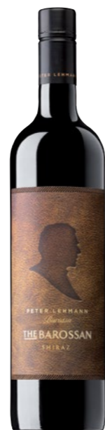
$25-$30 Peter Lehmann Wines The Barossan Barossa Valley Shiraz 2016 ★★★★★ $25