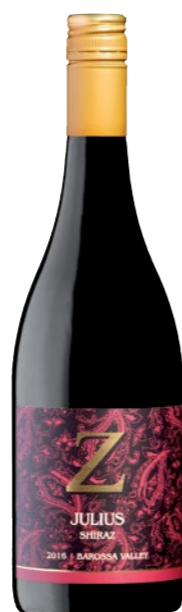
$60-$70 Z Wine Julius Single Vineyard Barossa Valley Shiraz 2016 ★★★★★ $60