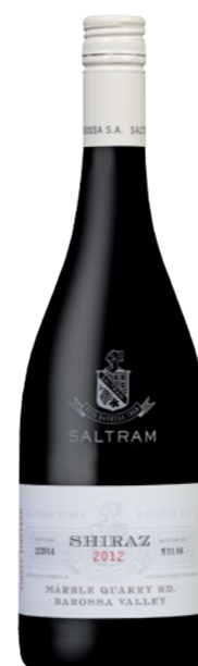
$80-$100 Saltram Single Vineyard Marble Quarry Road Barossa Shiraz 2012 ★★★★★ $99