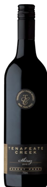
$50-$60 Tenafeate Creek Wines Museum Release One Tree Hill Shiraz 2010 ★★★★★ $55