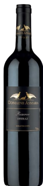
$45-$50 Domaine Asmara Reserve Heathcote 2016 ★★★★★ $49