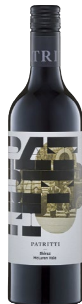
$20-$25 Patriitti Merchant McLaren Vale Shiraz 2016 ★★★★★ $24.99