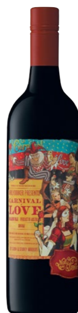
$70-$80 Mollydooker Carnival of Love McLaren Vale Shiraz 2016 ★★★★★ $75