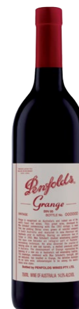
$200+ Penfolds Grange SA Shiraz 2013 ★★★★★ $1,140