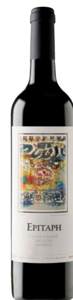
$100-$200 Reillys RCV Epitaph Clare Valley Shiraz 2014 ★★★★★ $100