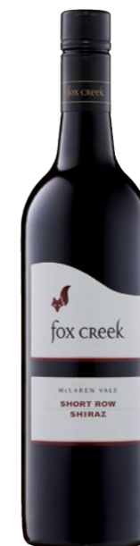
$35-$40 Fox Creek Short Row McLaren Vale Shiraz 2016 ★★★★★ $38