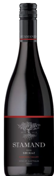
$15-$20 St Amand Barossa Shiraz 2016 ★★★★★1/2 $18