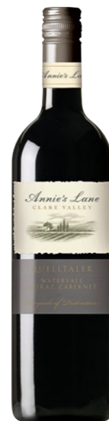
$25-$30 SHIRAZ BLEND WINNER Annie's Lane Quelltaler Clare Valley Shiraz Cabernet Sauvignon 2016 ★★★★★ $27.99