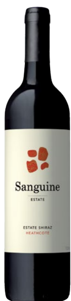
$40-$45 Sanguine Estate Estate Heathcote 2014 ★★★★★ $40