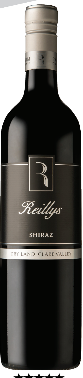
5 Star Winery & Ten Dark Horses James Halliday, 2016 Australian Wine Companion

Thomas Block, Leasingham, Clare Valley // Average Vine Age 61 yrs Estate Vineyards Rich red loam over deep limestone // Aspect E/SE // Elevation 375m 1919 Home Block, Leasingham, Clare Valley // Average Vine Age 41 yrs Rich red loam over deep limestone // Aspect W/SW // Elevation 400m